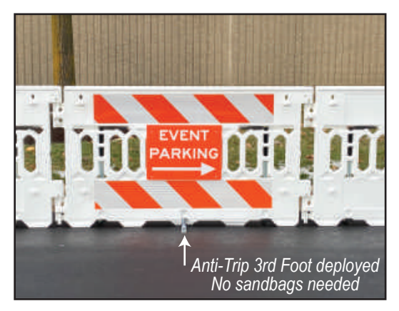
Add Signs for Crowd Control