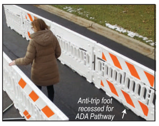
Create ADA Compliant Pedestrian Pathway